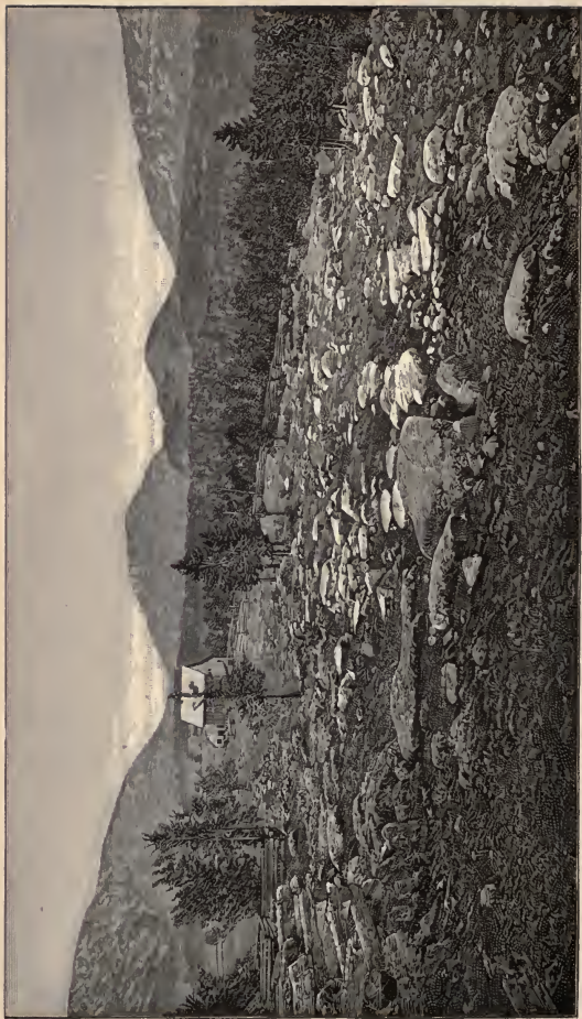
GLACIAL BOULDERS, MOUNT DESERT, MAINE.